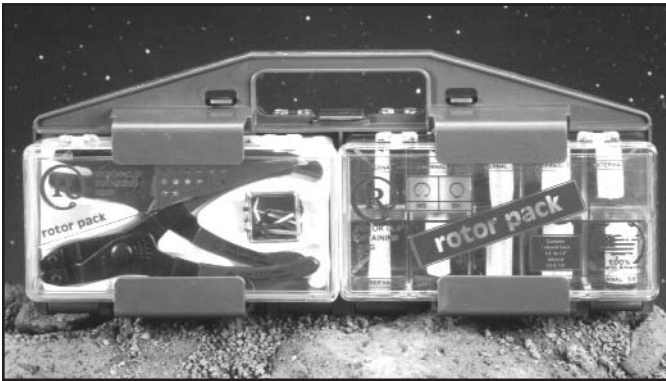
Rotor Pack - RPK#4

Also included are 2 pliers with tips which will fit every ring in the kit.